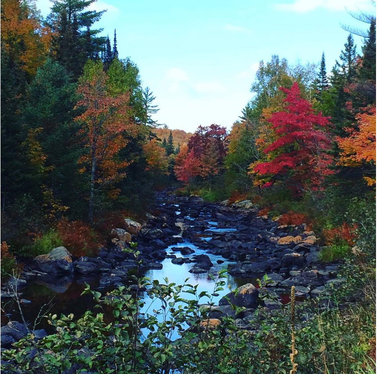
Autumn in the Superior Central Conference